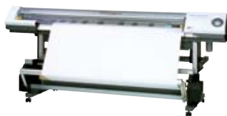
VersaArt™ RS-640 Most affordable high production 64" printer