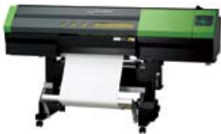
VersaUV LEC-300 UV print & cut

Call 0845 230 90 60 or email customerservice@rolanddg.co.uk