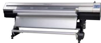
SolJet™ Pro III XJ-740 High production, outstanding performance 6-colour printer