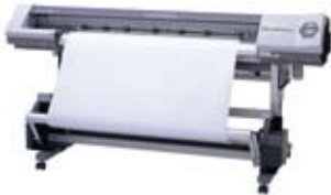
VersaCAMM™ VP-540 Fastest entry level print & cut