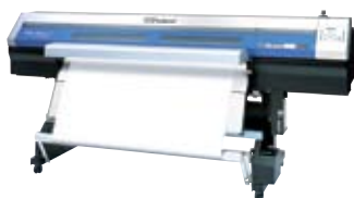
SolJet™ Pro III XC-540 High productivity print & cut